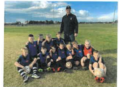
Boys Soccer Team