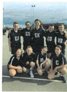
Mixed Netball Team