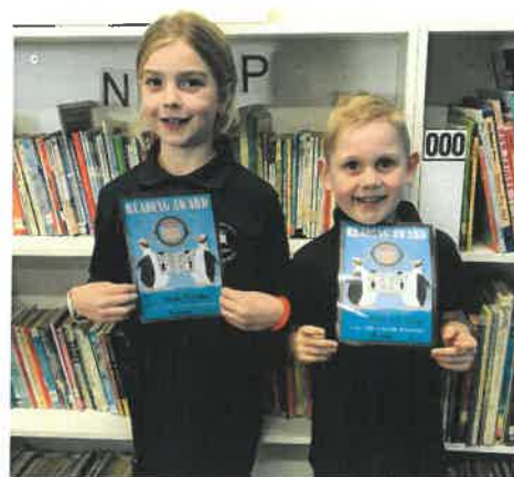
Chelsea PM & Smith

Be Safe - Be Respectful - Be Strong - Be Your Best