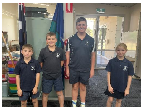
BAT TENNIS CHAMPS